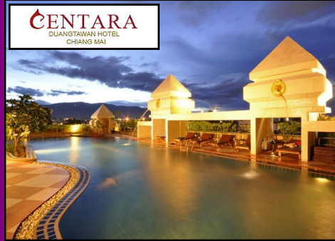
CENTARA DUANGTAWAN HOTEL CHIANG MAI