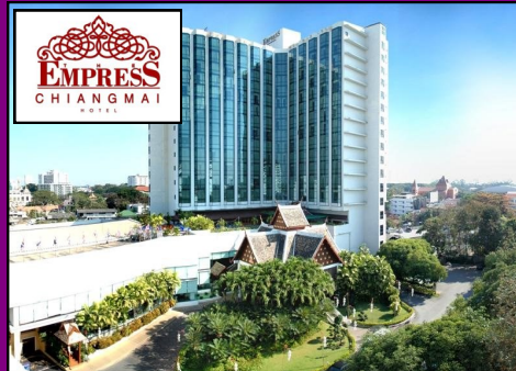
EMPRESS CHIANG MAI HOTEL