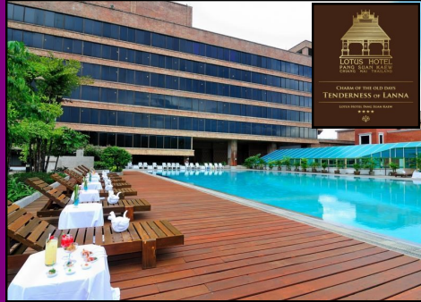
LOTUS HOTEL CHANGMAI CHANGMAI TENDERNESS OF LANNA