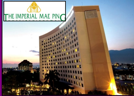
THE IMPERIAL MAE PING